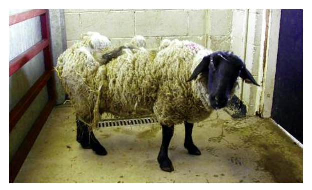
Fig. 1 A scrapie-affected sheep.

Scrapie (Fig. 1), a disease of sheep and goats, has been known under several names for some 200 years ("rubbers", "rickets", "goggles", "shakings", "shrewcroft" in England; "scratchie", "cuddie trot" in Scotland; "der Trab", "der Traberkrankheit", "die Zitterkrankheit" in Germany; "la maladie convulsive", "la maladie follie", "le tremblante", "la prurigo lombaire" in France; and "trzęsawka" in Poland). Scrapie was first reported in Spanish merino sheep in 1732 [70]. Following an outbreak of scrapie in Lincolnshire, British sheep farmers petitioned the Parliament to introduce some legal regulations to stop the movement of sheep. The importation of Spanish merino sheep introduced scrapie to